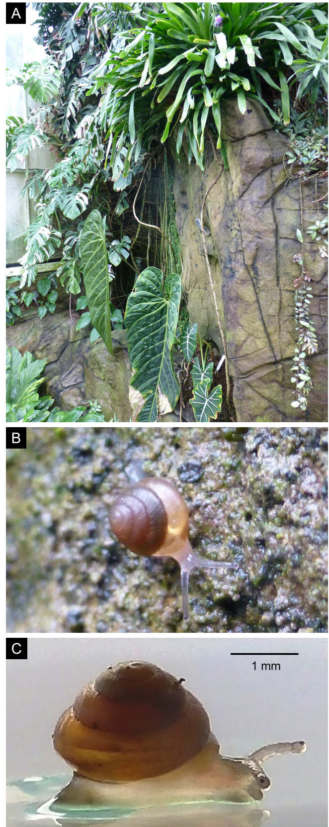
Figure 2. The Wisley habitat (A) and living animal (B, C).