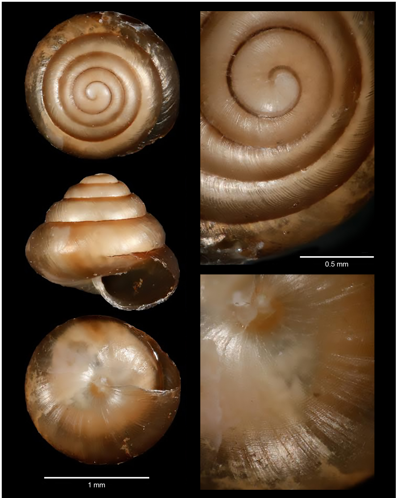
Figure 3. Shell of an individual from Wisley, 2017 (NMW.Z.2021.013.0218).