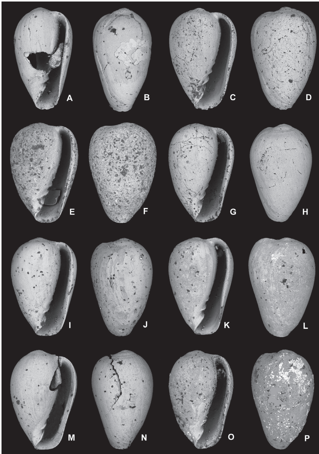
Figs 4A–B Cystiscus cf. angustus sp. nov., L=1.24mm, Walters Shoal, Stn DW 4879, 288–300m. Figs 4C–D Cystiscus profundus sp. nov., holotype MNHN-IM-2000-38482, L=1.13mm, Walters Shoal, Stn DW 4899, 707–720m. Figs 4E–F Cystiscus cf. profundus sp. nov., L=1.68mm, Walters Shoal, Stn DW 4886, 573–582m. Figs 4G–H Cystiscus granum sp. nov., holotype MNHN-IM-2000-38483, L=1.75mm, Walters Shoal, Stn DW 4881, 377–382m. Figs 4I–J Cystiscus dentiferus sp. nov., holotype MNHN-IM-2000-38484, L=1.44mm, Walters Shoal, Stn DW 4887, 599–640. Figs 4K–L Cystiscus alatus sp. nov., holotype MNHN-IM-2000-38485, L=1.42mm, Walters Shoal, Stn DW 4879, 288–300m. Figs 4M–N Cystiscus apertus sp. nov., holotype MNHN-IM-2000-38486, L=1.28mm, Walters Shoal, Stn DW 4881, 377–382m. Figs 4O–P Cystiscus contortus sp. nov., holotype MNHN-IM-2000-38487, L=1.37mm, Walters Shoal, Stn DW 4887, 599–640m.