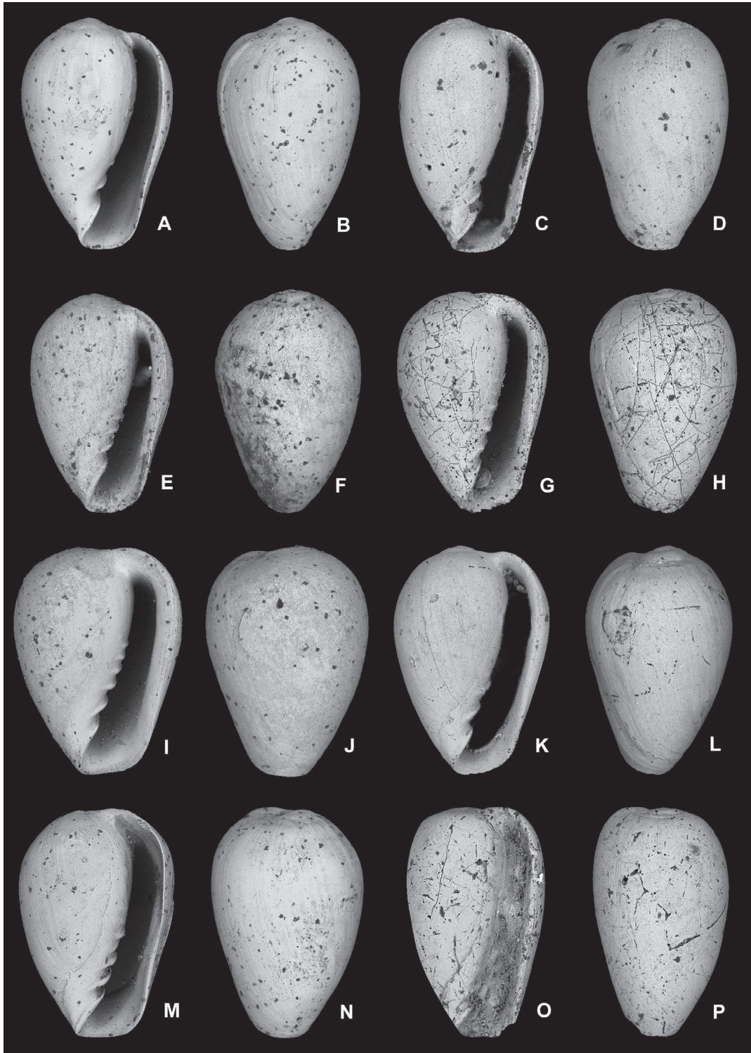
Figs 5A–B Cystiscus sinuosus sp. nov., holotype MNHN-IM-2000-38488, L=1.86mm, Walters Shoal, Stn DW 4893, 623–629m. Figs 5C–D Cystiscus pupoides sp. nov., holotype MNHN-IM-2000-38489, L=1.25mm, Walters Shoal, Stn DW 4887, 599–640m. Figs 5E–F Cystiscus lussii sp. nov., holotype MNHN-IM-2000-38490, L=1.55mm, Walters Shoal, Stn DW 4880, 275–318m. Figs 5G–H Cystiscus smithi sp. nov., holotype MNHN-IM-2000-38492, L=1.53mm, Walters Shoal, Stn DW 4880, 275–318m. Figs 5I–J Cystiscus serratus sp. nov., holotype MNHN-IM-2000-38493, L=1.46mm, Walters Shoal, Stn DW 4893, 623–629m. Figs 5K–L Cystiscus lachrymaformis sp. nov., holotype MNHN-IM-2000-38494, L=1.65mm, Walters Shoal, Stn DW 4881, 377–382m. Figs 5M–N Cystiscus quinqueplicatus sp. nov., holotype MNHN-IM-2000-38495, L=1.67mm, Walters Shoal, Stn WS 04, 40m. Figs 5O–P Cystiscus sp. A, L=1.25mm, Walters Shoal, Stn 4879, 288–300m.