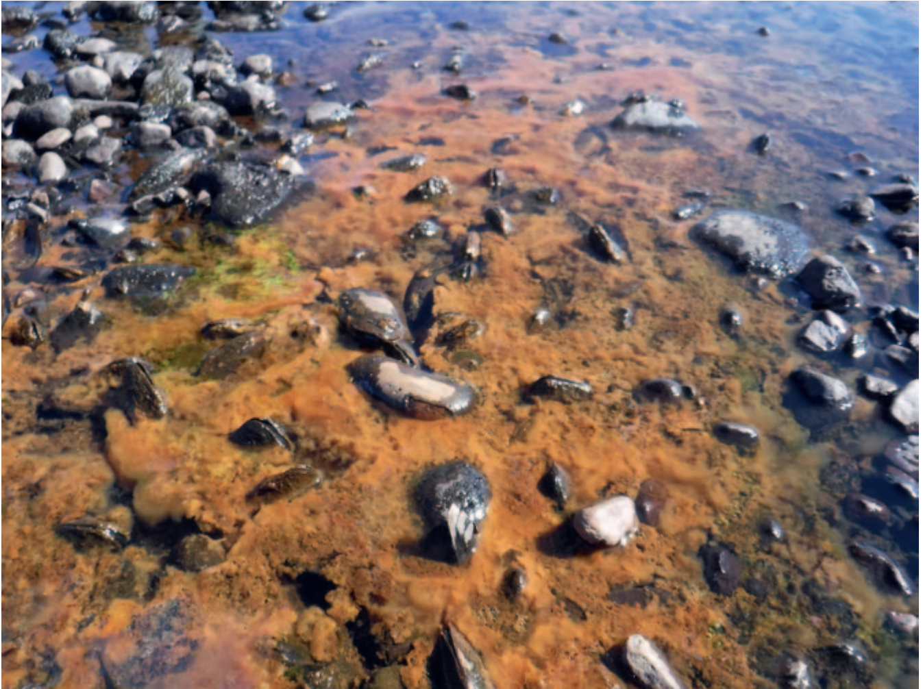
Figure 3 Pearl mussels at severe risk of death in stagnant pool River 1, July 2018.

emergency measures enacted to create a small channel which directed modest fresh flows into the stagnant pool. Thus, a worse-case assessment that all pearl mussels in the stagnant pool at risk of drying out in 2018 subsequently died is not borne out by the 2019 survey evidence.