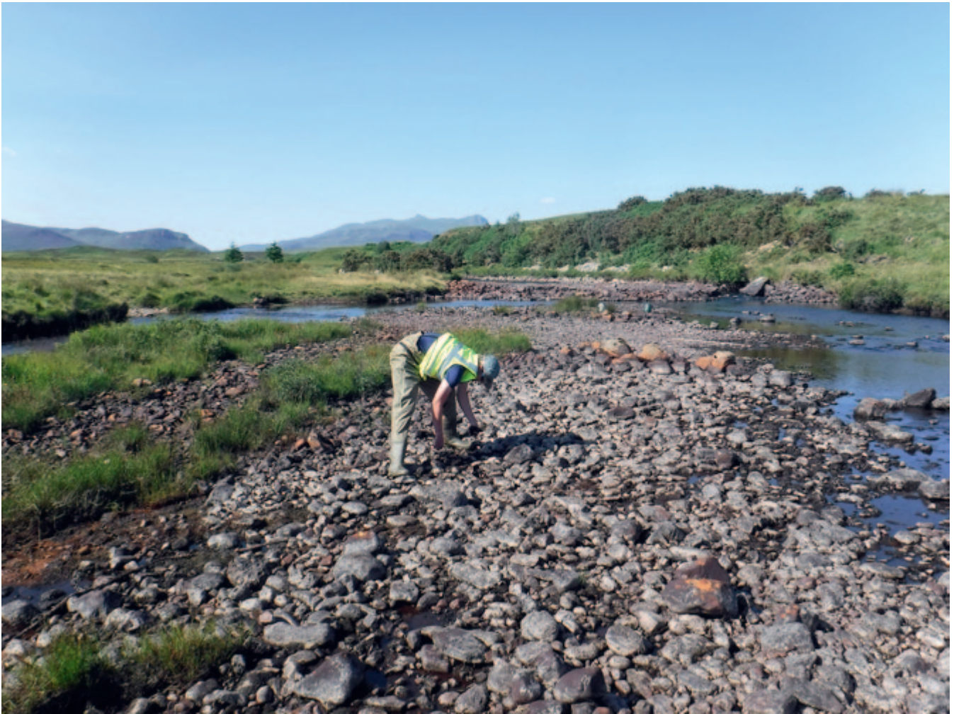
Figure 1 A ca. 5m wide exposed mussel bed, River 1, July 2018. As an emergency conservation measure, hundreds of live stranded pearl mussels were moved into deeper water by the authors.

previous and current surveys, results also show a downward trend in status categories (Table 3).