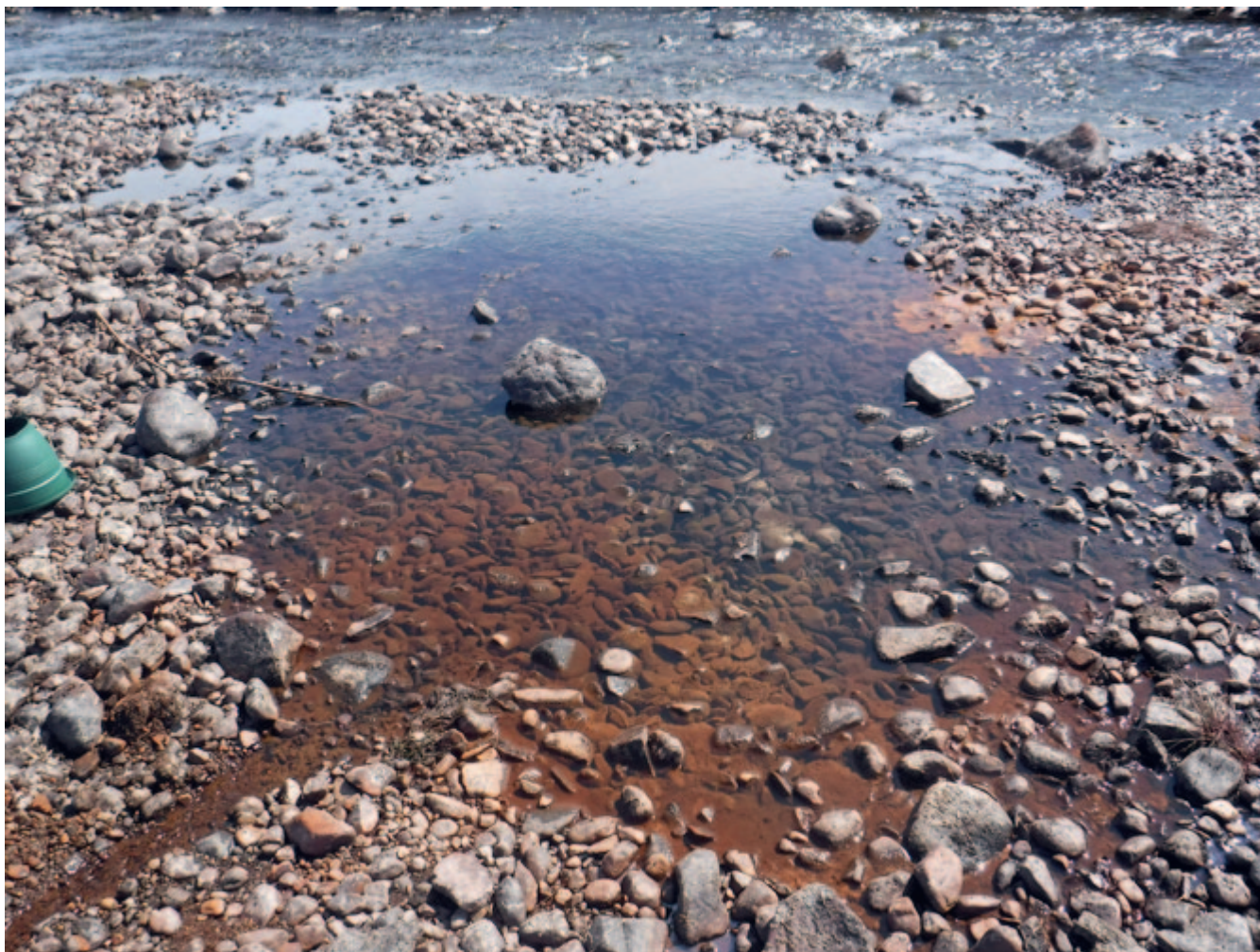
Figure 4 Stagnant pool, River 1 with ca. 1,500 pearl mussels, surrounded by dried out mussels, July 2018. Note the small channel dug by the author's heels in the bottom left of the photo, as an emergency measure to increase water flows into the shrinking pool.

that was already declining due to other factors, including mortality associated with an extreme flood (2014), unauthorised river works, and illegal pearl fishing. The evidence of the recent (2019) pearl fishing kill shows other detrimental factors continue to adversely affect and threaten this vulnerable and declining north of Scotland SAC pearl mussel population.