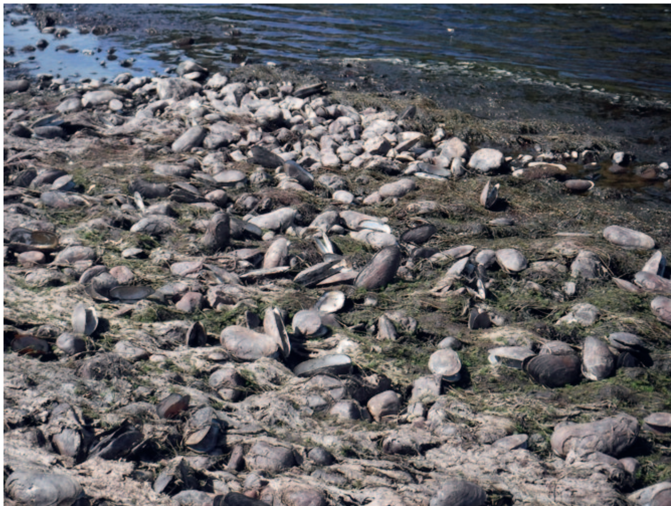
Figure 2 A typical dried out pearl mussel bed, River 1 with many dead shells in situ, July 2018.