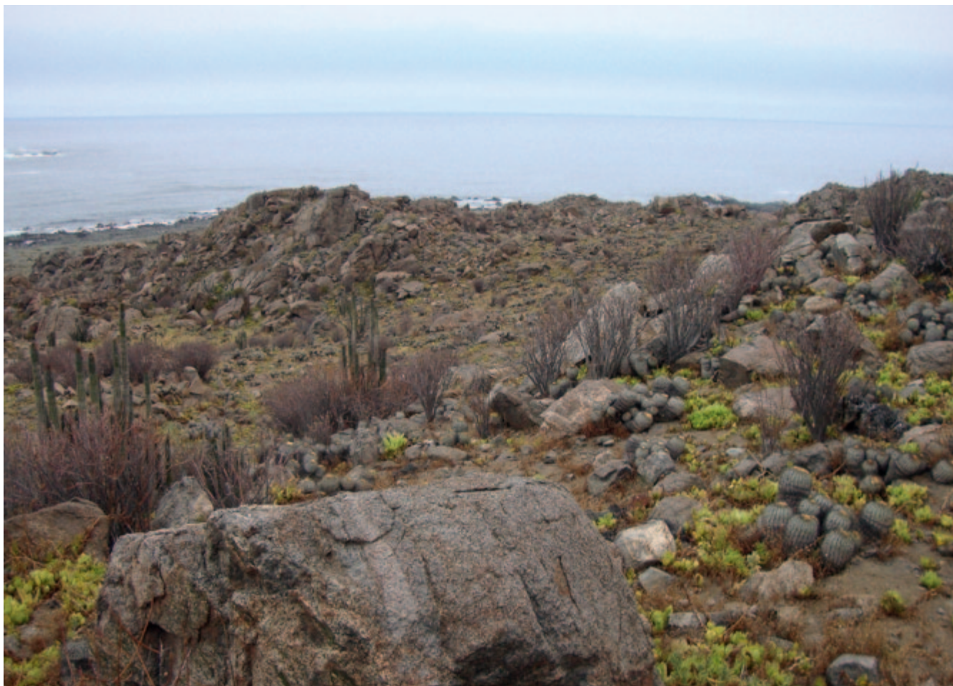
Figure 2 Type locality and habitat of Stephacharopa paposensis n. sp., under native bromeliads and cacti, Paposo, northern Chile.

locality, is highly associated to litho-refugia in sea-facing hills of the Chilean Coastal Range, which are the only areas which sustain permanent or semi-permanent vegetation in northern Chile.