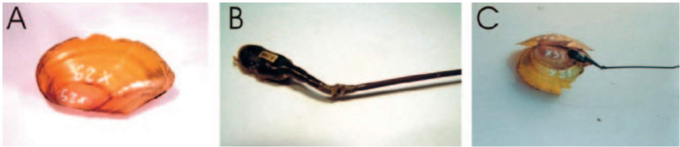
Figure 1 Evidence of otter attack on swan mussels: A shell edges showing clear bite marks; B bite marks on radio transmitter antenna; C mussel shell destroyed by otter, with transmitter antenna also showing bite marks at the base and end of the antenna.

experiment with data on predation based on shells collected near an otter's den.