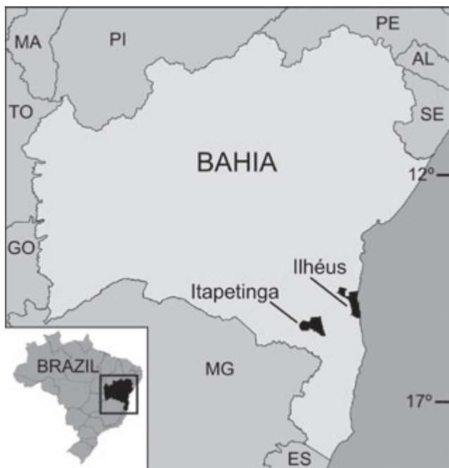
Figure 1 Map showing the municipalities where Oxychona maculata sp. nov. occurs. Modified from http://commons.wikimedia.org . Abbreviations of states: MA, Maranhão; PI, Piauí; PE, Pernambuco; AL, Alagoas; SE, Sergipe; TO, Tocantins; GO, Goiás; MG, Minas Gerais; ES, Espírito Santo.

Distribution Brazil, known only from the state of Bahia, from the municipalities of Ilhéus (type locality) and Itapetinga (Fig. 1).