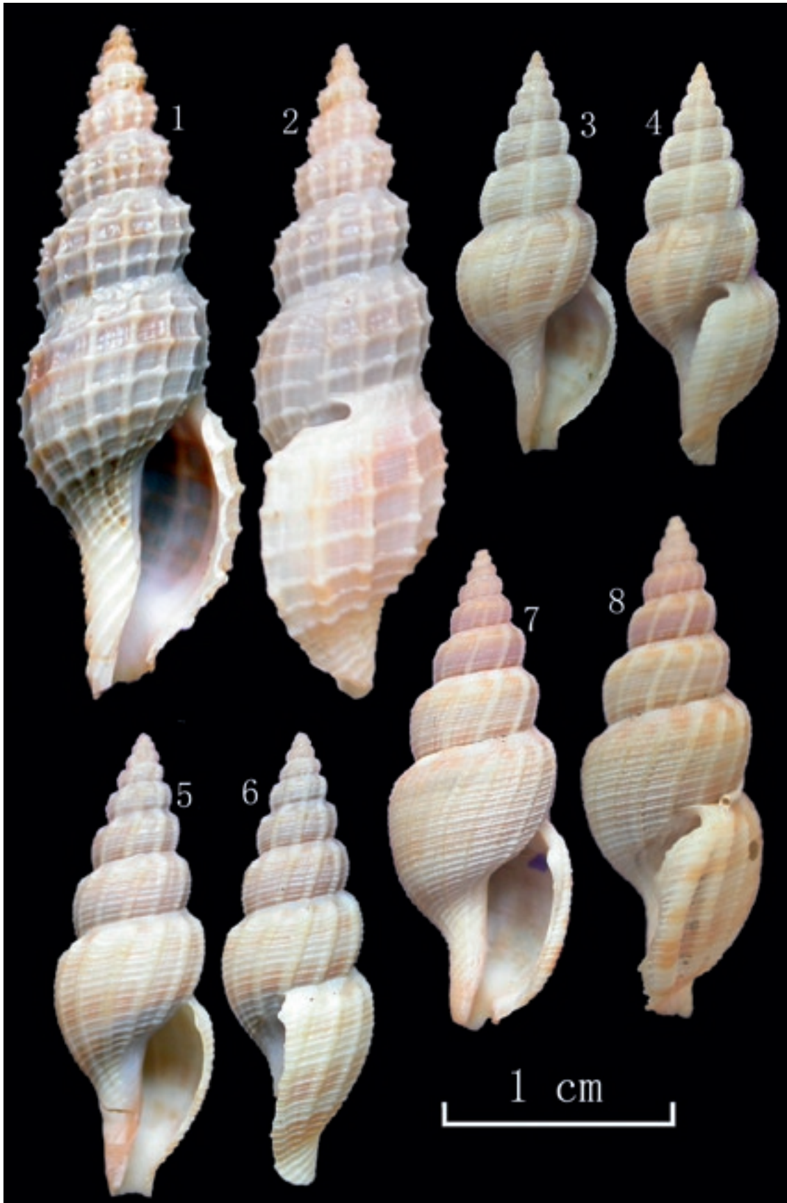
Figures 1–8 1, 2, Tritonoturris oxyclathrus (CN L67B-8); 3, 4, T. scalaris (CN S79B-50); 5–8, T. macandrewi (5, 6, CN Q283B-22); (7, 8, CN X200B-63).