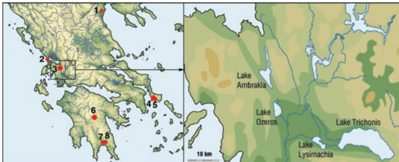
Figure 1 The sampling sites. 1: Litothoro ( Pseudobithynia zogari n. sp.), 2: Preveza ( P. zogari ), 3: Lake Ambrakia ( P. ambrakis ), 4: Euboea, ( P. euboensis ), 5: Euboea, ( P. zogari ), 6: Taka Lake ( Bithynia hellenica ), 7: Skala town, canal ( P. zogari ), 8: Evrotas river near Skala town city ( P. zogari ).

In his original description, Kobelt (1892: 67) mentioned that the surface of the shell was latticely sculptured, and he used this feature as a means of distinguishing B. hellenica from B. orsinii . However, in none of the 8 syntypes that we were able to study could we find this feature. Concerning the distribution, he mentioned that this species populated Greece and the islands of the archipelago.