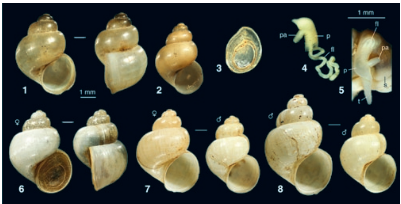
Figure 2 Bithynia hellenica . 1–2: Syntypes, 1: this specimen was already depicted by Kobelt (1891, pl. 137, fig. 860), 3–9: B. hellenica from Lake Taka. – fl = flagellum, p = penis, pa = penial appendix, s = snout, t = tentacle.

Material examined Greece, Lake Ambrakia, 1985, leg. A. Falniowski