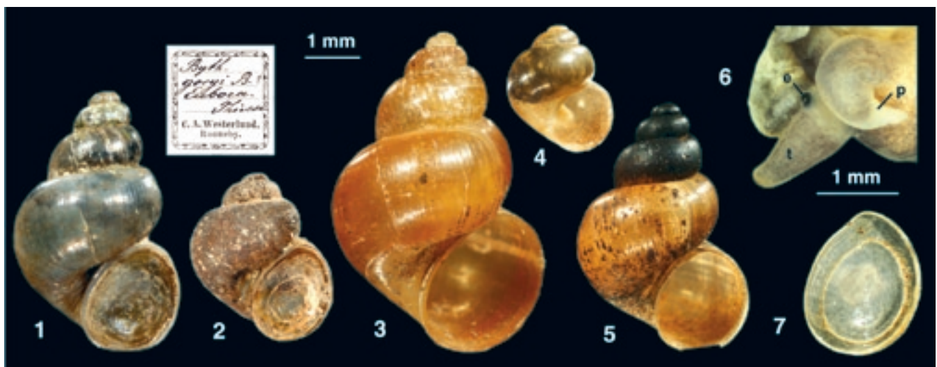
Figure 5 Pseudobithynia zogari n. sp. – 1–2: “ Bithynia goryi B.?” from Westerlund’s collection = P. zogari n. sp., 3–7: P. zogari n. sp. – e = eye, p = penis, t = tentacle.

Description Shell glossy and reddish horn-coloured, surface finely striated, 5–5.5 whorls