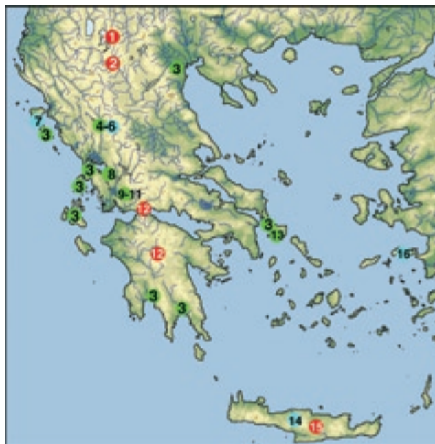
Figure 6 The distribution of the Bithyniidae in Greece. The genus are marked by coloured dots: red = Bithynia , green = Pseudobithynia , cyan = unknown genus. 1: Lake Prespa, B. prespensis , 2: Lake Kastorias, B. kastorias , 3: Lowlands of Greece, P. zogari , 4–6: Lake Pamvotis (Lake Ioannina, 4: P. westerlundii , 5: Bithynia graeca ; 6: P. hemmeni , 7: Corfu, P. renei , 8: Lake Ambrakia, P. ambrakis , 9–11: Lake Trichonis: 9: P. trichonis , 10: P. panetolis , 11: P. falniowskii , 12: B. hellenica , 13: P. euboensis , 14: Crete, Bithynia candiota . 15: Crete, B. cretensis , 16: Samos: P. gittenbergeri .

At the beginning of the research into the Bithyniidae of Greece only two Bithynia spp. were known from this region, now about 16 species are recognised which belong to two genus groups. In summary we can say that the distribution pattern of the Bithyniidae in Greece is not stochastic through passive dispersal, the main process that disperses freshwater mollusks into new lentic habitats outside drainage systems, is random. Despite this latter fact, the effective immigration rate resulted in a zoogeographical distribution pattern. We can split the Bithyniidae in Greece into three groups: (i) those that live endemically in ancient lakes, (ii) those that live endemically on islands, and (iii) those that are widely distributed in the lowlands of Greece (Fig. 6). The latter group seems to consist of only one Bithynia sp. and two Pseudobithynia spp. All the other fourteen