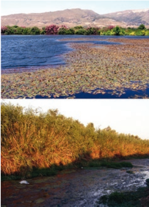
Figure 4 Sampling sites of the new Pseudobithynia zogari . top: Island Evia, bottom: Skala town, canal (type locality).

from this species by the operculum, which is in P. euboensis not cochleate and the penis of the latter species is broader with a small penis tip.