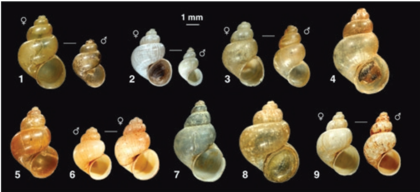
Figure 8 The Pseudobithynia spp. of Greece. – 1: Pseudobithynia panetolis , 2: P. falniowskii , 3: P. trichonis , 4: P. gittenbergeri , 5: P. zogari , 6: P. euboensis , 7: P. westerlundi , 8: P. hemmeni , 9: P. ambrakis .